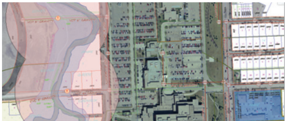
Access to up-to-date information enables better analysis. Here a natural hazard analysis considers the potential overflow areas affected by the sewers, managed using the industry models that lie within the flood zone.

Using AutoCAD Map 3D, designers and managers can overlay layers of GIS and CAD data to create more complete base maps of existing conditions and gain a more accurate view of proposed designs in a real-world context. Autodesk® Storm and Sanitary Analysis 2012, software that is included with Map 3D, allows users to perform hydrology and hydraulic analysis for planning of urban drainage systems, storm sewers and sanitary sewers. In addition, users can conduct spatial analysis to better understand project impact and help to inform critical design and management decisions earlier in the process. A comprehensive library of co-ordinate systems helps to geo-reference data.